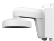
DS-1273ZJ-130B Wall Mount with junction box